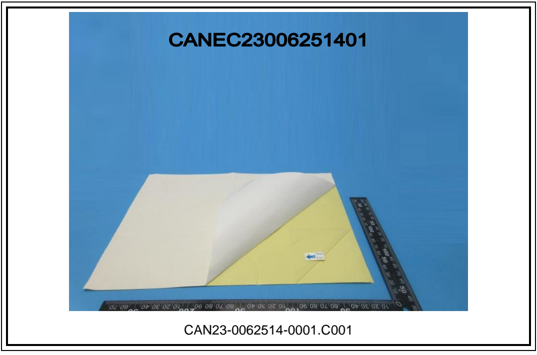
SGS authenticate the photo on original report only *** End of Report ***