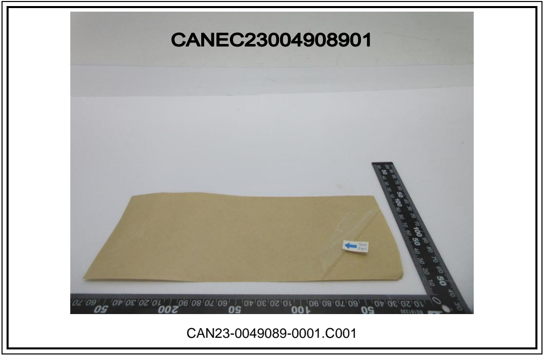
SGS authenticate the photo on original report only *** End of Report ***