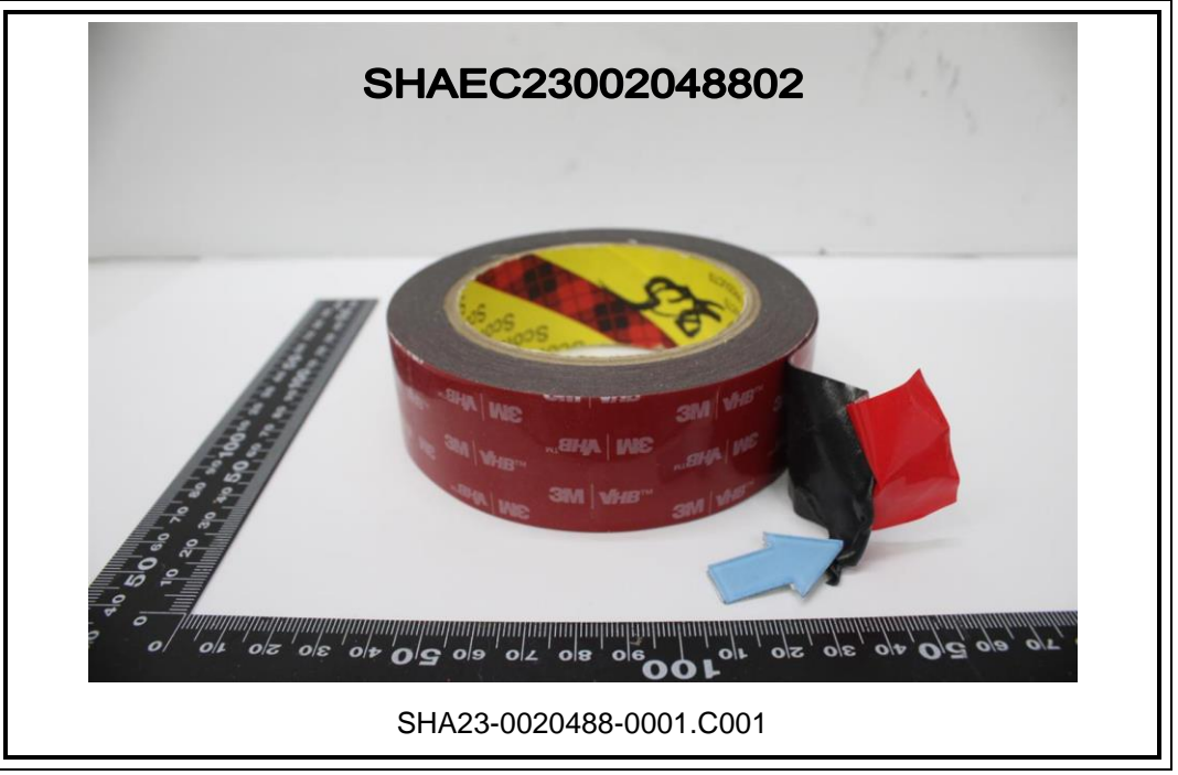
SGS authenticate the photo on original report only *** End of Report ***