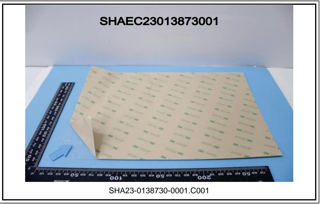
SGS authenticate the photo on original report only *** End of Report ***